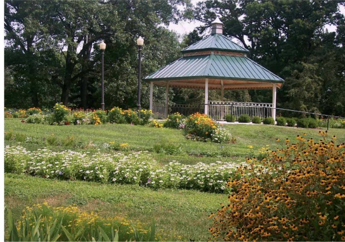
⑥- OVERLOOK PAVILION