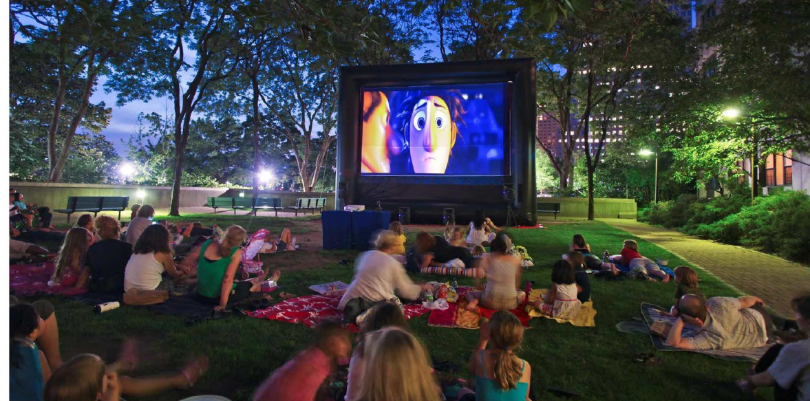
⑦- COMMUNITY ACTIVITIES