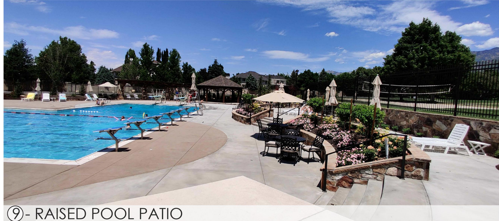
⑨- RAISED POOL PATIO

ATTENTION: PRIOR TO PERFORMING ANY WORK ON THIS PLAN CONTRACTOR SHALL IDENTIFY THROUGH BLUESTAKES AND ON-SITE OBSERVATION ANY AND ALL UTILITIES AND HAZARDS OR CONDITIONS THAT MAY PREVENT WORK FROM BEING PERFORMED ACCORDING TO THESE PLANS ABOVE OR BELOW GROUND. IF CONDITIONS ARE FOUND THAT MAY PREVENT WORK FROM BEING PERFORMED AS PER PLAN, CONTRACTOR SHALL CONTACT LANDSCAPE ARCHITECT PRIOR TO PROCEEDING. ANY DAMAGE TO UTILITIES SHALL BE THE CONTRACTOR'S SOLE RESPONSIBILITY (I.E. ELECTRICAL, GAS, WATER SEWER, ETC.). EVERY EFFORT HAS BEEN MADE TO ENSURE ACCURACY WITH THESE DRAWINGS. QUANTITIES (I.E. AND IT) LISTED ARE FOR REFERENCE ONLY. CONTRACTOR SHALL VERIFY ALL MEASUREMENTS AND QUANTITIES ON THESE PLANS. ARCHITECT SHALL NOT BE RESPONSIBLE FOR DISCREPANCIES BETWEEN QUANTITIES LISTED IN LEGENDS AND PLAN. WHERE DISCREPANCIES EXIST BETWEEN SPECIFICATIONS, DETAILS, AND/OR DRAWINGS, CONTRACTOR SHALL CONTACT LANDSCAPE ARCHITECT PRIOR TO PROCEEDING. CONTRACTOR SHALL INSPECT THE SITE TO VERIFY THAT DRAWINGS ARE CONSISTENT WITH SURVEYED BASE INFORMATION. DURING CONSTRUCTION IF DISCREPANCIES ARE FOUND BETWEEN THESE PLANS AND THE SITE, CONTRACTOR SHALL CONTACT THE LANDSCAPE ARCHITECT PRIOR TO PROCEEDING.