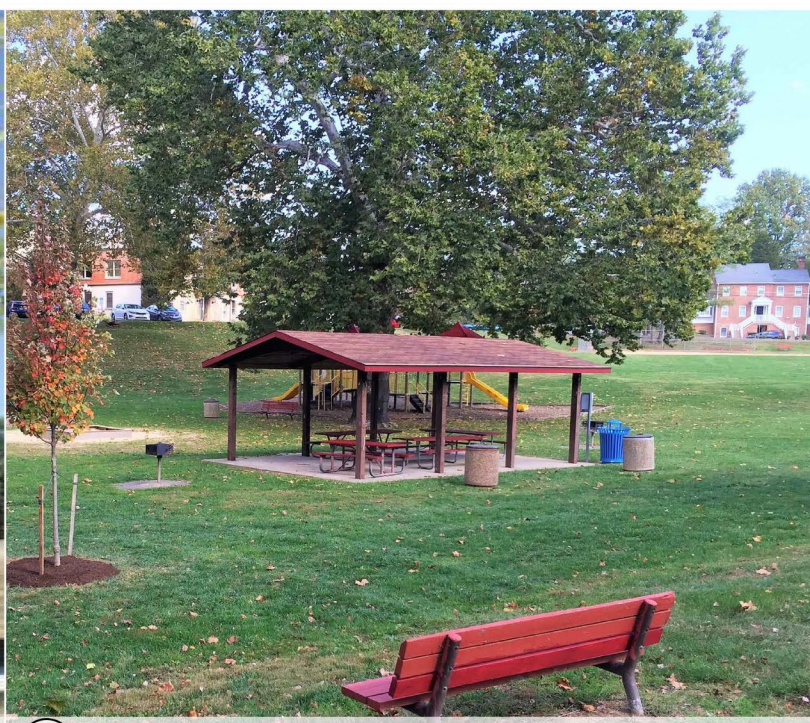
③- PICNIC AREAS