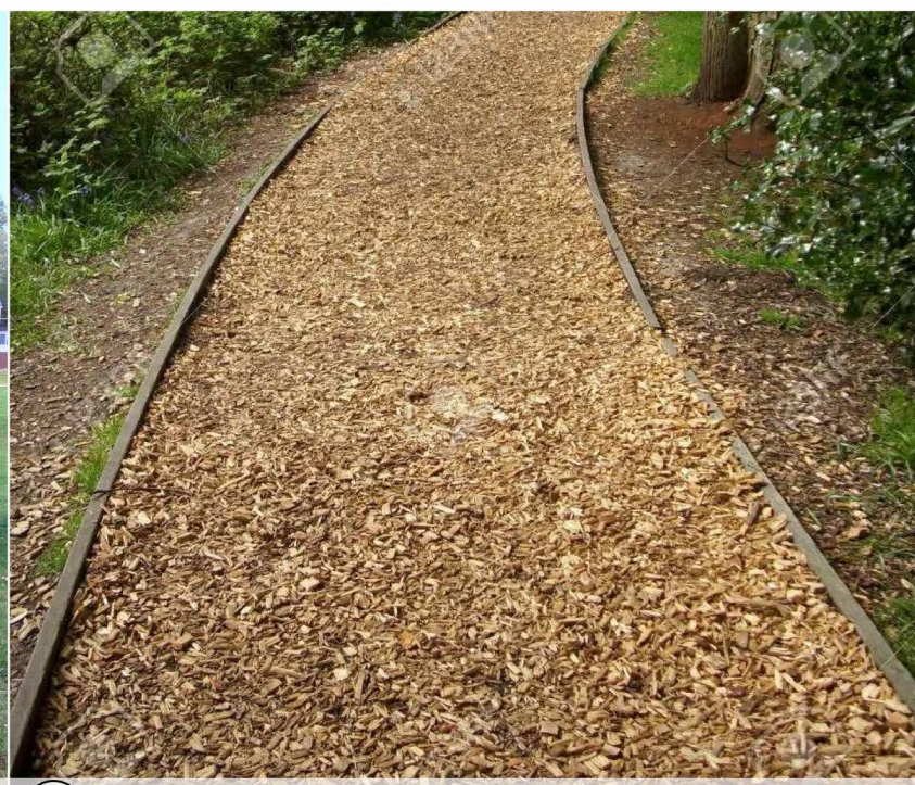
④- WALKING PATH