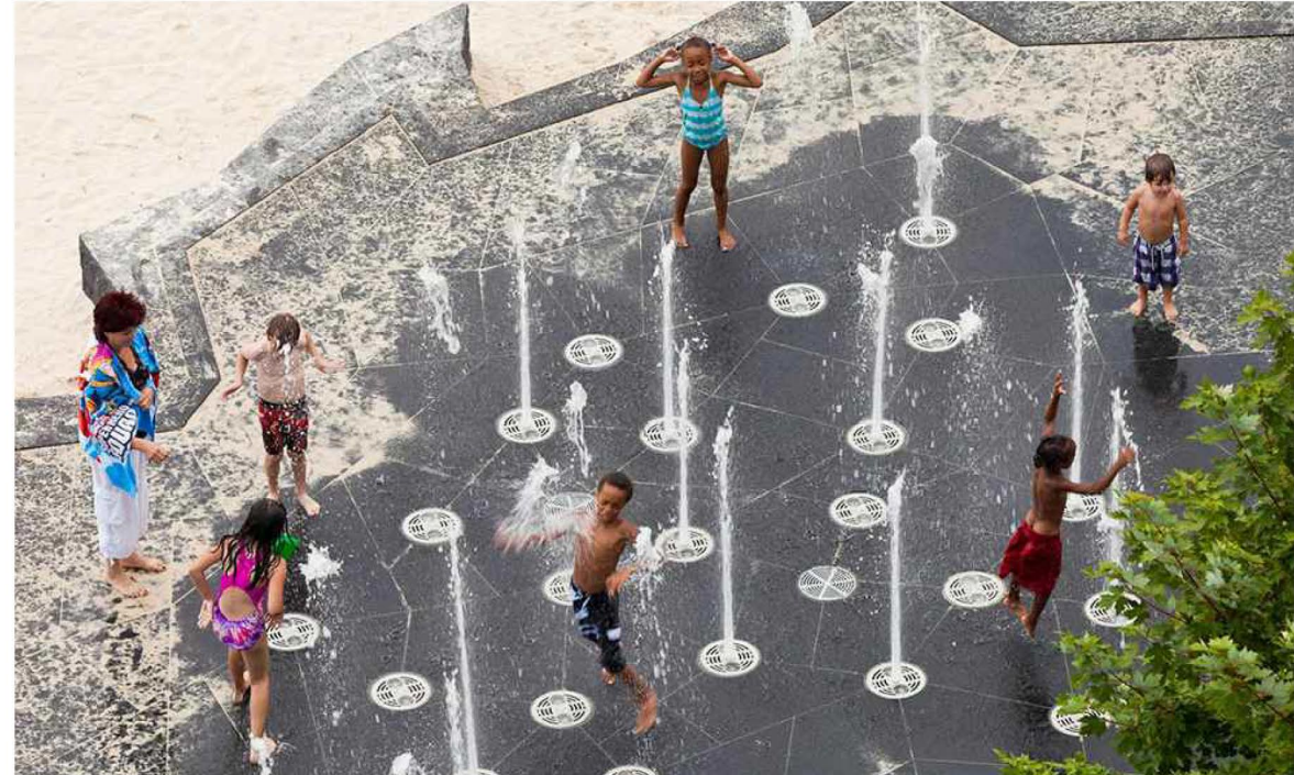
⑧- SPLASH PAD