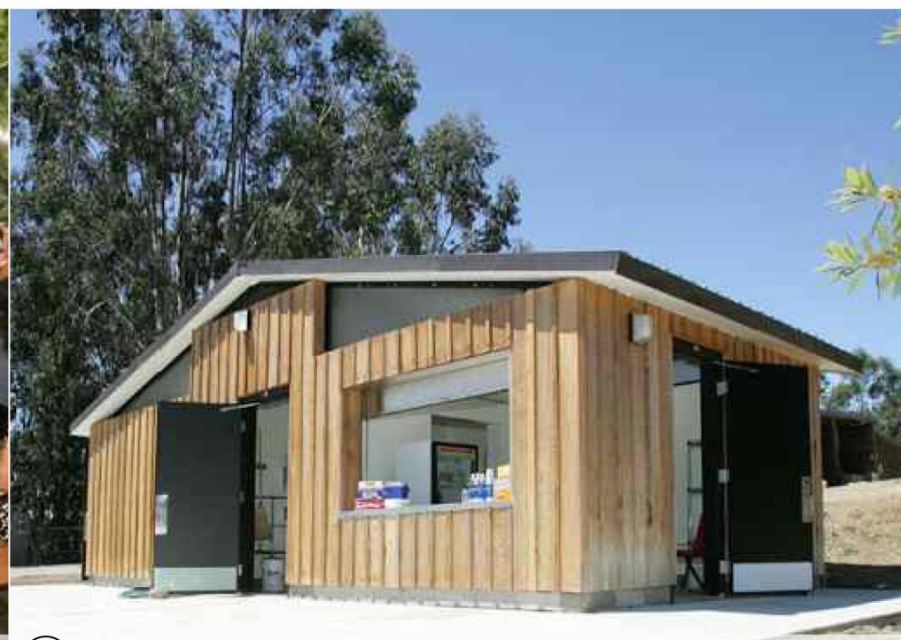
②- CONCESSIONS BUILDING