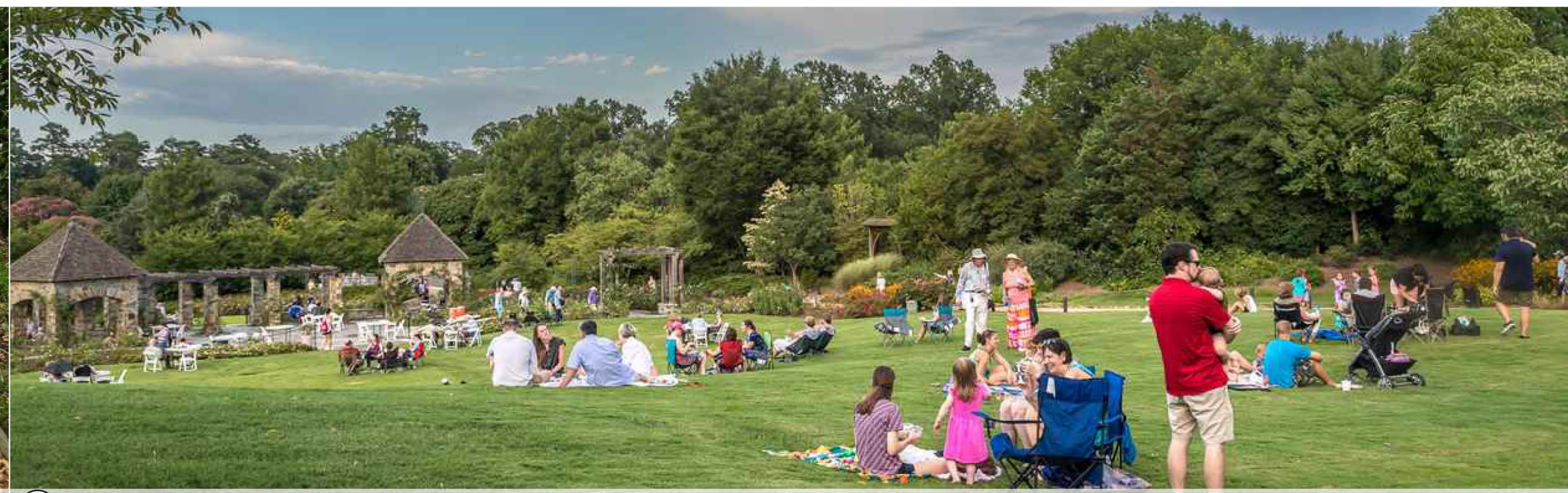
⑤- TERRACED LAWN