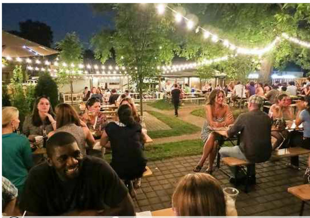
①- COMMUNITY PATIO